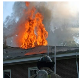
First due House Fire

The Company is comprised 100% by volunteers. Everyone from the newest probationary firefighter, to the Chief of the Department, is a volunteer. There is no bi-weekly check for our duties. The volunteers are comprised of your neighbors, people who hold jobs in town, family members, your friends, and those who have a strong desire to help those in need. They are just like you, people who hold extremely active lives outside of work and outside of the fire department too. They still manage to find time to give back to the community that has offered so much for them.