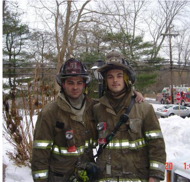
Members after a first due structure fire

The fire service is one of the most challenging, intensive, and diverse callings available today. Every day is different when it comes to the emergencies we are called to. Requests for our services are up, and the types of emergencies that we are called to are constantly expanding. This expansive service attracts many people to our ranks.