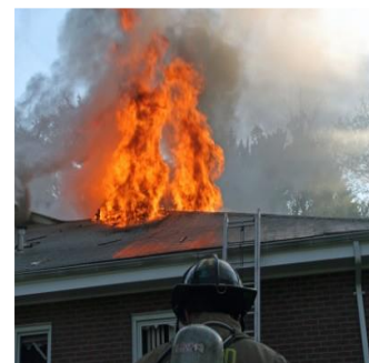
First due House Fire

The Company is comprised 100% by volunteers. Everyone from the newest probationary firefighter, to the Chief of the Department, is a volunteer. There is no pay check for our duties. The volunteers are comprised of your neighbors, people who hold jobs in town, family members, your friends, and those who have a strong desire to help those in need. They are just like you, people who hold extremely active lives outside of work and outside of the fire department too, yet they still manage to find time to give back to the community that has offered so much for them.